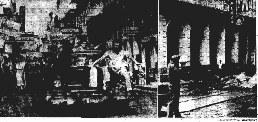
CELEBRATIONS, LOOTING FOLLOW FLIGHT OF CUBAN STRONGMAN This group of demonstrators celebrating the flight of Cuban strongman Fulgencio Batista rides their flag-draped automobile through the streets of Cuba. At right Havana policemen fire on rebel partisans in an effort to stop looting at the gambling casino in the Hotel Plaza in downtown Havana.