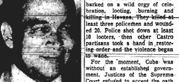
FULGENCIO BATISTA Flees Cuba